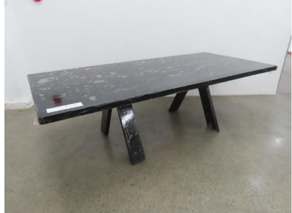
Overall View - After Test