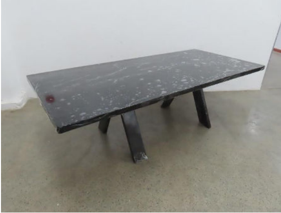
Overall View - Before Test